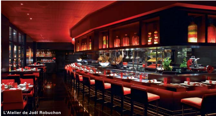
L'Atelier de Joël Robuchon

Advice from gourmands about the Las Vegas cuisine scene? Forget buffets. There's award winning fare to be savored.