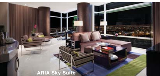
ARIA Sky Suite