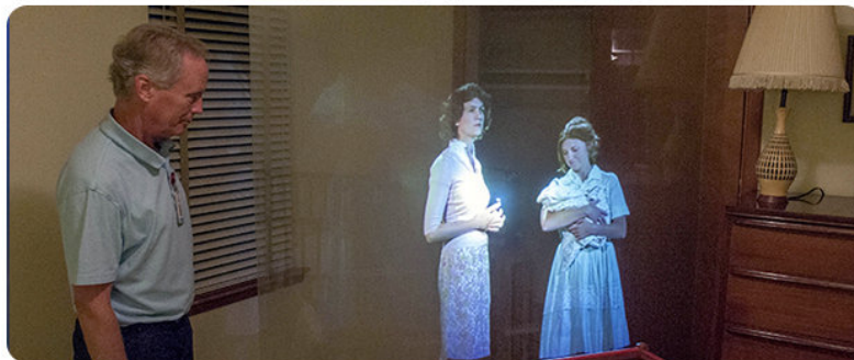
A gallery of the Paine House.