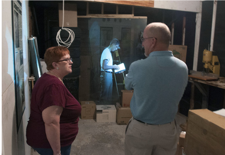
A projection of an actor portraying Lee Harvey Oswald in the Paine Museum garage.