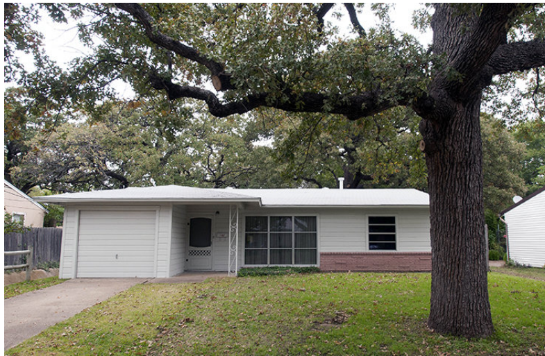
The Ruth Paine House Museum in Irving opens Wednesday.