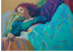
Image 2: Bre Barnett Crowell, Carmen , 2016, pastel on paper, 17 x 22 inches