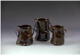
Image 6: Aaron R Moseley, Sassy Trio , 2018, clay, 6 x 10 x 4 inches