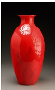
Image 5: Ben Owen III, Dogwood Vase , 2018, earthenware, 30 x 16 x 16 inches