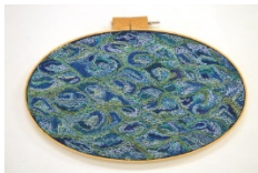
Image 4: Summer Rezeli, Her Element was Water , 2017, DMC Thread on Muslin in Embroidery Hoop, 14 x 24 inches