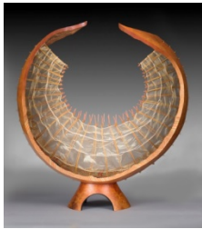
Image 1: Carol Kroll, Networking , 2015, gourd, acrylic, copper, fiber, 25 x 22 x 7.5 inches