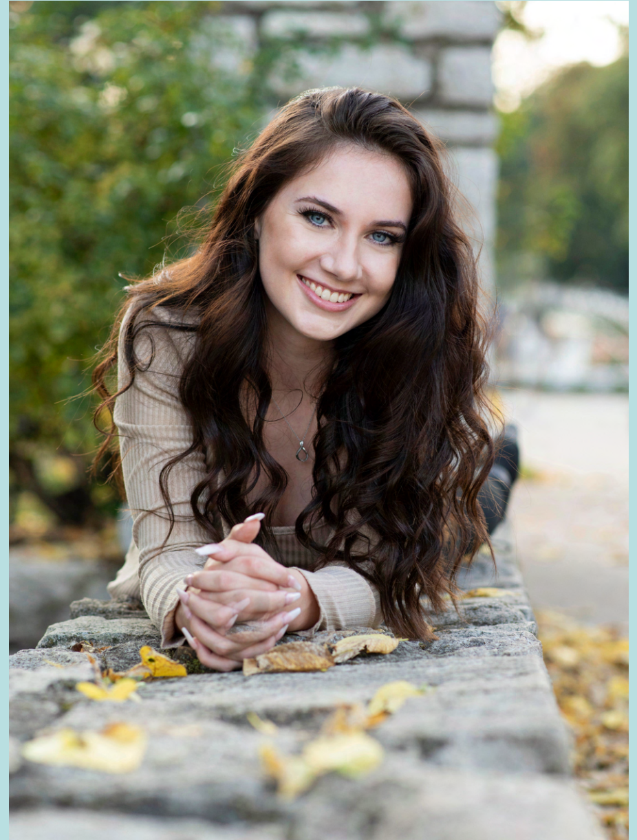
FAMILY & SENIOR PORTRAITS WITH AMBER DAWKINS PHOTOGRAPHY